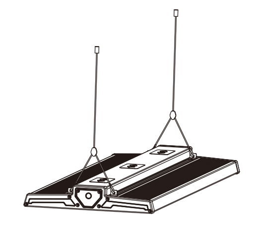
Step 2 Connect ropes with high bay properly and make sure the high bay is hanging straight